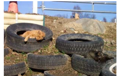
Hobie & Tilt

Tara Farm is home to llamas, a pot bellied pig, chickens, rabbits, donkeys, cows, goats, Chow dogs, and our special cats. Tara Farm has included a special project for many years, of FIV and Feline Leukemia cats who come to the farm to live out their lives. The cats have a wonderful time on the farm, in their shelter with lots of beds, a wood stove to keep them warm when its cold, and lots of friends (of every species!). They also have insulated houses throughout the farm, woods and barns to play in. They are frequently found snoozing in the farm's trucks! If you've been to the farm, you've no doubt met a few of these special residents.