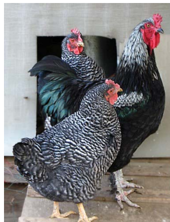
Some of the resident chickens